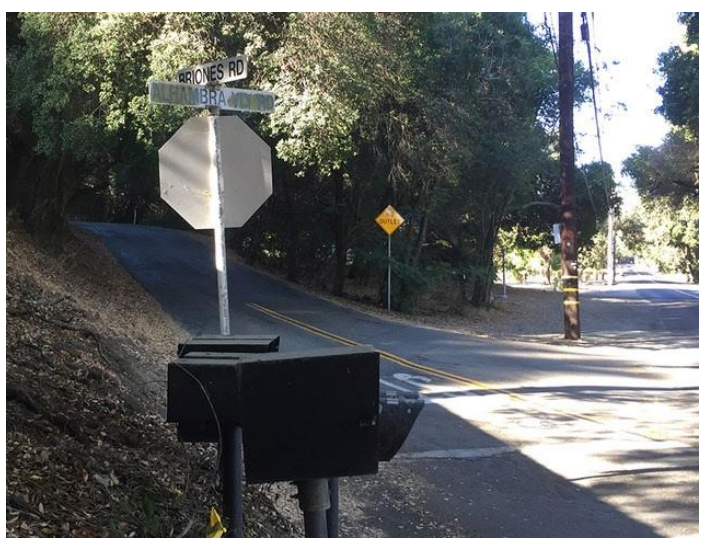
Left turn coming from Pleasant Hill