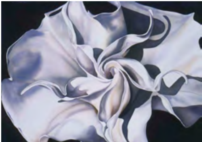
White Flower by Birgit O'Connor