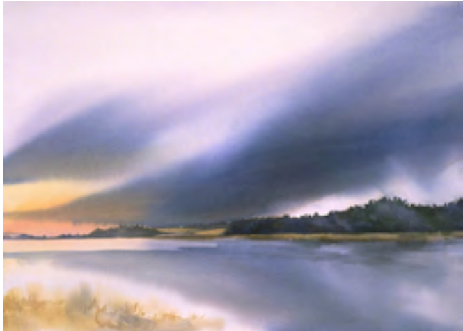
Landscape by Birgit O'Connor