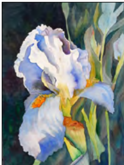
Blue Iris by Bonnie Crosse