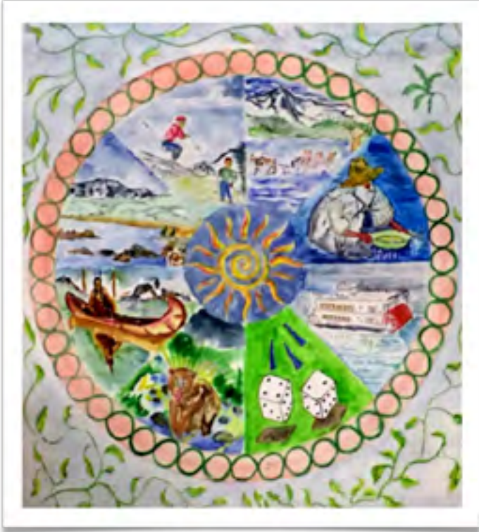
Fun in the Sun Tahoe Style

Art can help you find your way. Landmark navigation is boosted by veteran's art at Martinez VA Hospital.