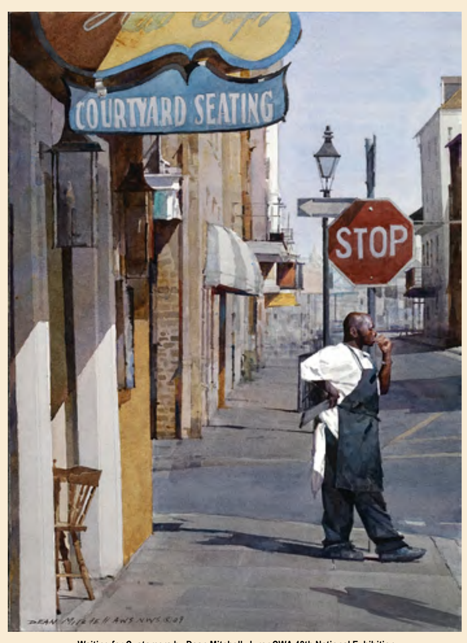
Waiting for Customers by Dean Mitchell, Juror CWA 48th National Exhibition

national@californiawatercolor.org CWA National Exhibition Committee