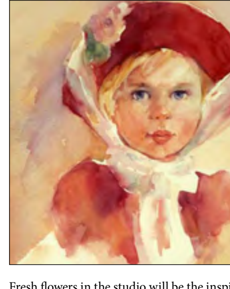
Janet Rogers Expressive Watercolors – Flowers, Faces & Figures, Mixed Media Faces and Figures 4 Days | October 16-19 Advanced Beginner and Up CWA Members $495, Non-Members $550