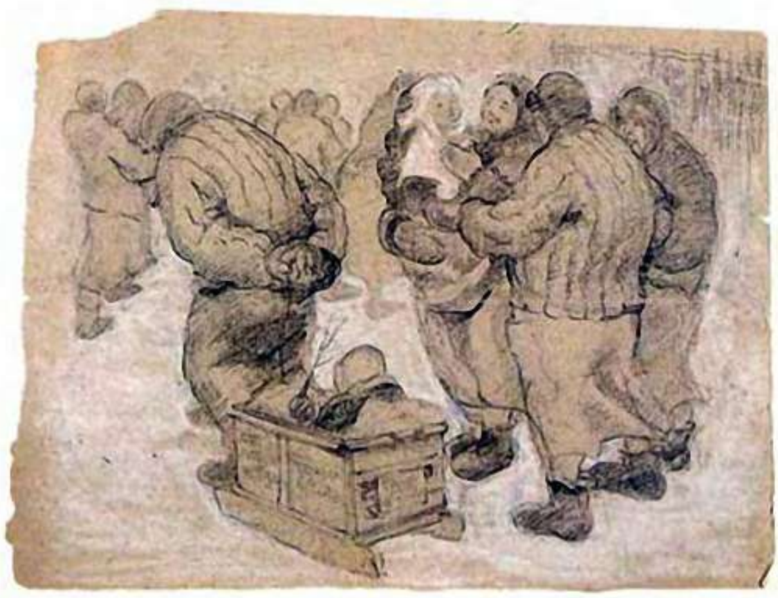
Our Children Walking by Nadezha Borovaya. Wrapping paper, pencil drawing, chalk. 21 x 28 cm.