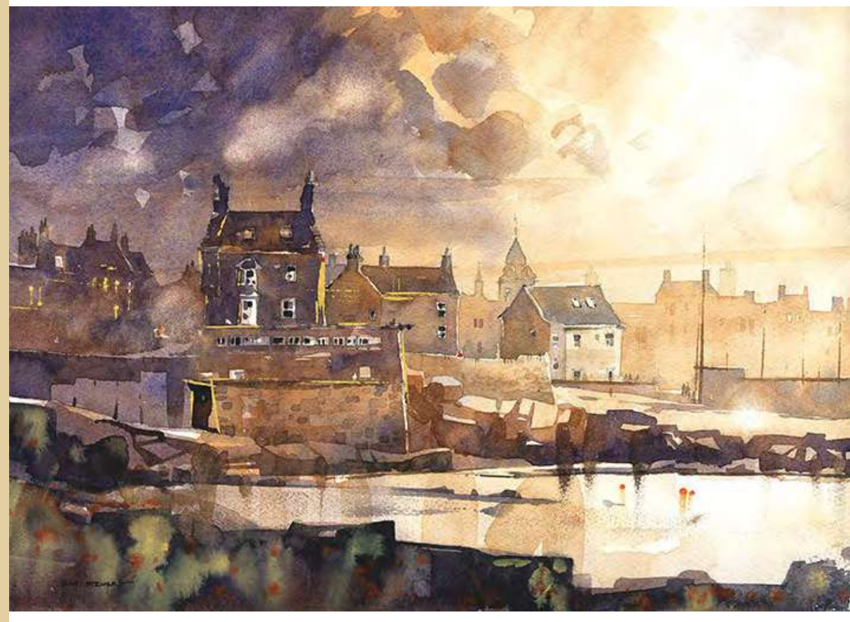
Queensferry, Scotland