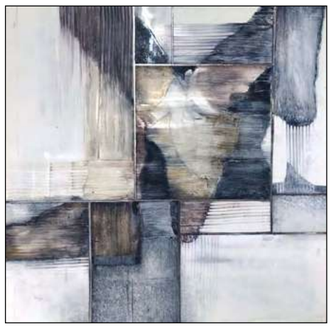
4 Steps - Watercolor on Mixed Media Surface