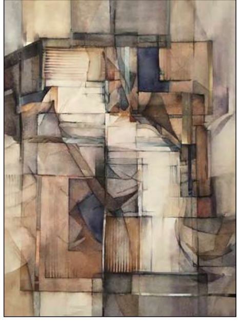
Interlocking - Watercolor on Paper with Collage

For more information on Taryn, visit her website at http://taryncuriel.com.