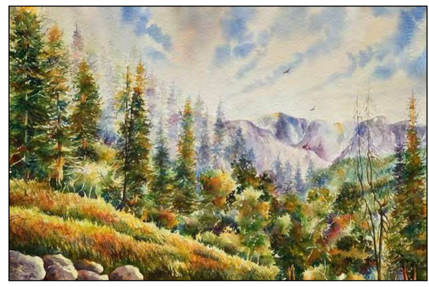
Austrian Alps