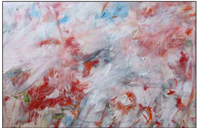
Flowering, Mixed Media on Yupo by Dee Tivenan