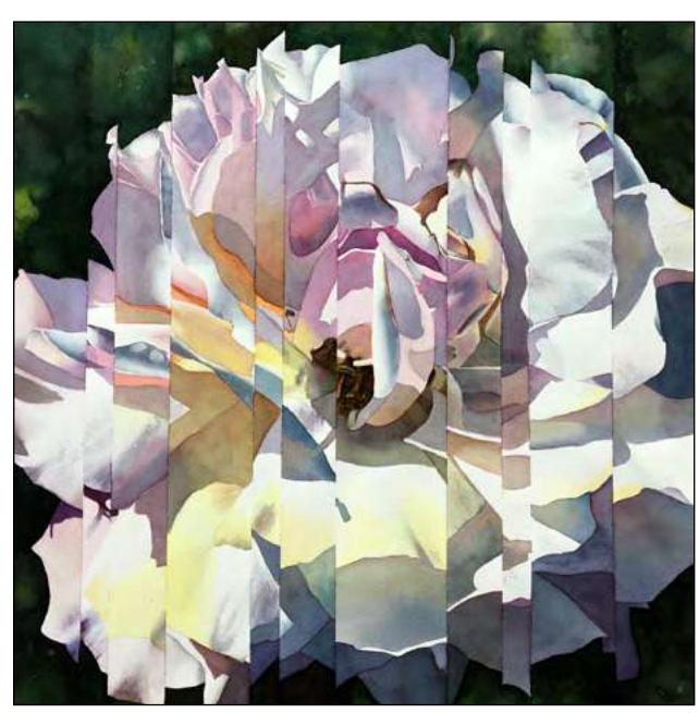
Earthquake Rose by Iretta Hunter