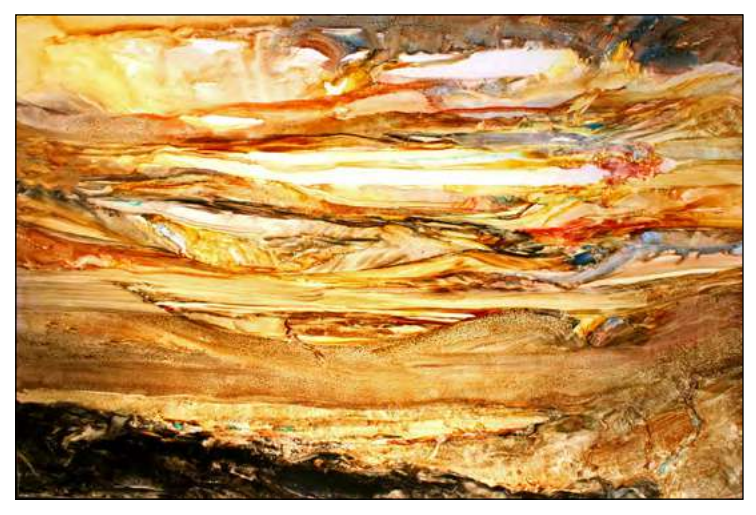
Continuation of Time by Juanita Hagberg