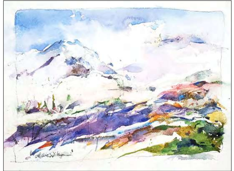
Holiday Card 2020 by Leslie Wilson

I learned about “mixing up” the elements of design and other actions to create exciting ways of directing the viewer’s eye through the painting. For example, an uneven use of values (lights, darks, mid-tones) is more exciting than an even distribution of values. If there are too many small