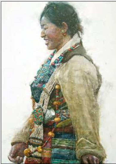
Touch of Light Snow by Dongfeng Li