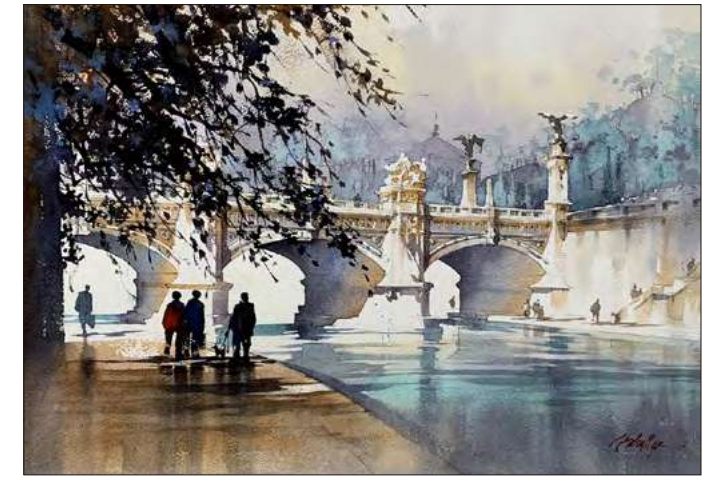
San Martino, Lucca and Vittorio One by Thomas W. Schaller

Thomas W. Schaller, AWS, NWS, TWSA, sees watercolor as a natural extension of the act of drawing. Except that in watercolor, we "draw" not with a line, but with shapes: shapes of value, of tone and color, and of light. So, as we paint, we literally carve away at that total amount of light shining from the pure white of the paper. And so, if we can begin to see ourselves as "painting with light," with its structures and its forms, rather than with the structure and forms