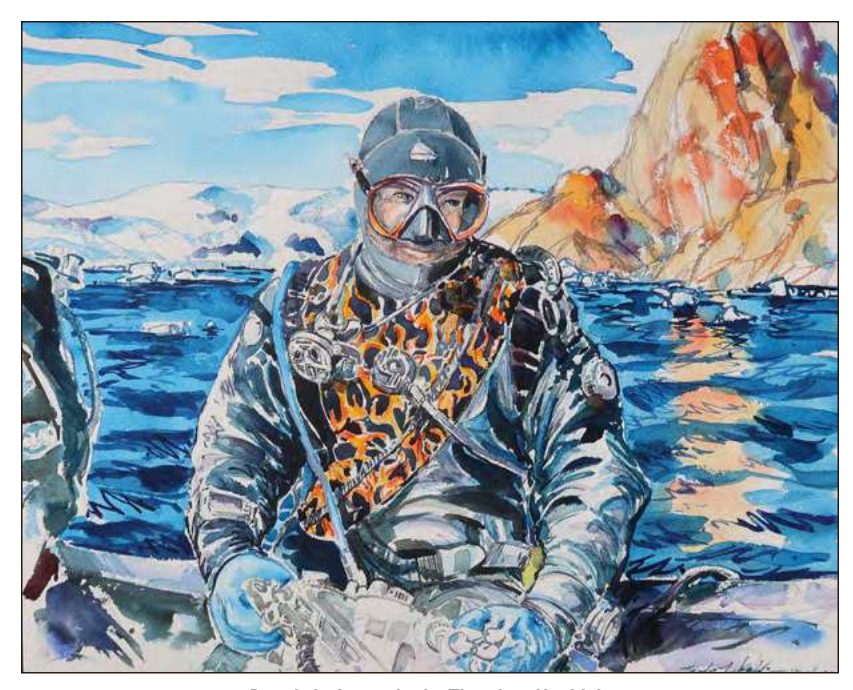
Dennis in Antarctica by Theodore Heublein

Artist's website at www.theodoreheubleinart.com