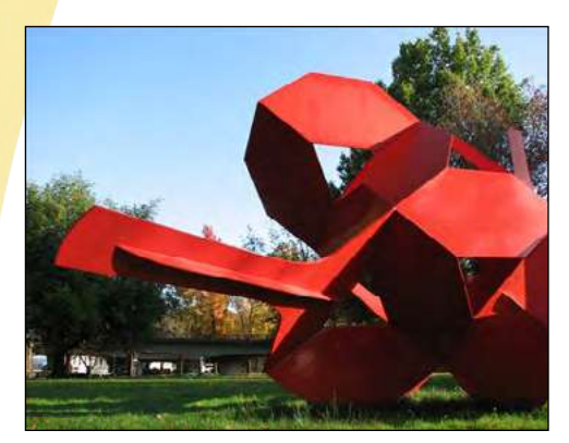
"Big Red - Eugene Oregon"