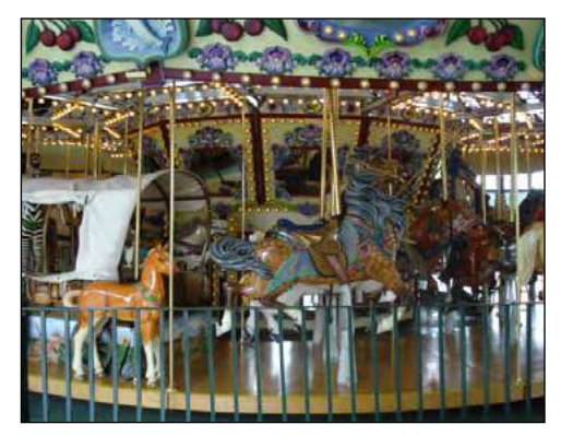
"Salem's Riverfront Carousel"