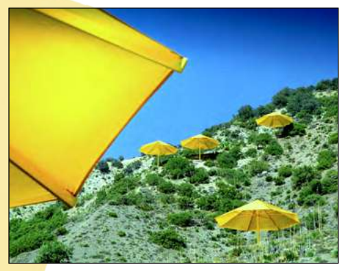
"Christo's Umbrellas 1991" by Jon Delorey is licensed under CC BY-ND 2.0