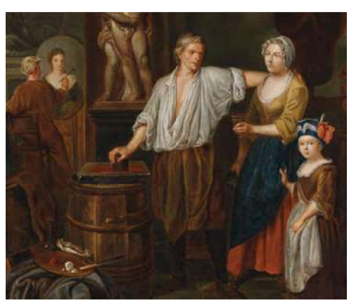
A colourman grinding pigment