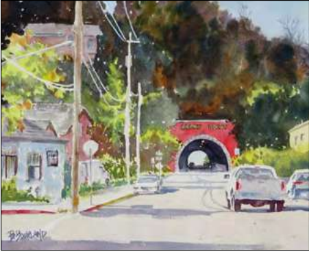
Ferry Point Tunnel, Pt. Richmond by Beth Bourland

Artist website at https://bethbourland.wordpress.com