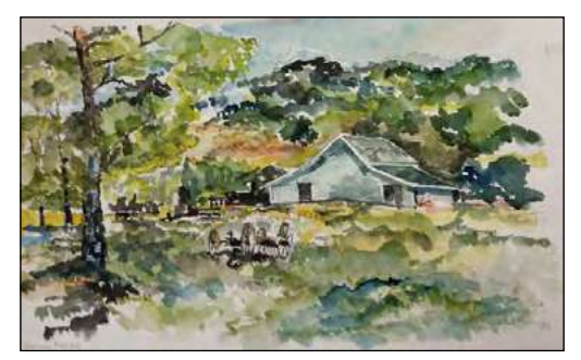
Watercolor by Chuck Dorsett