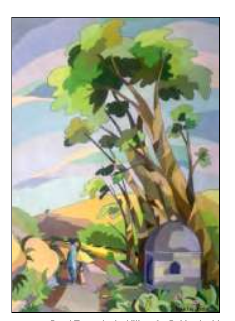
Road Towards the Village by Rekha Joshi