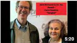
CWA 50th National Art Show at the Harrington Gallery