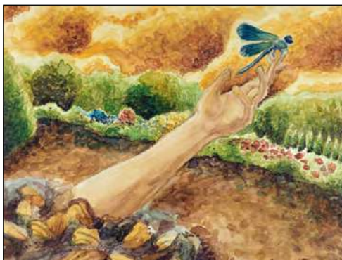
Phoebe Owen (11th–12th Category)