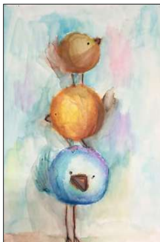
Madelyn Woo (6th–8th Category)