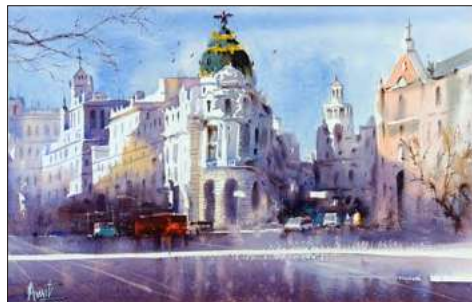
Streets of Madrid, and Streets of Mumbai by Amit Kapoor

Special note — time difference in India.