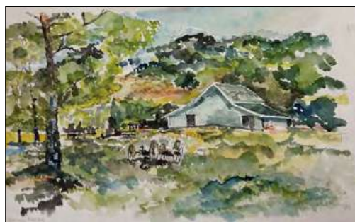
Watercolor by Chuck Dorsett