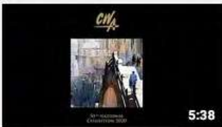
CWA 50th National Show 2020