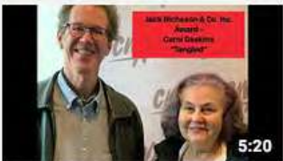
CWA 50th National Art Show at the Harrington Gallery