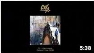
CWA 50th National Show 2020