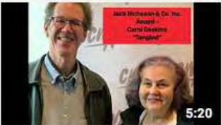
CWA 50th National Art Show at the Harrington Gallery