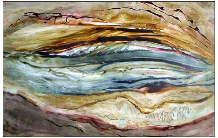
Running Marble Canyon