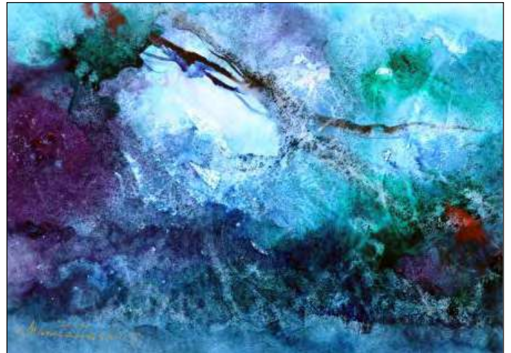
New Wave III by Juanita Hagberg