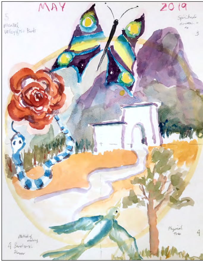
Above: A version of the Maori Symbol Guide