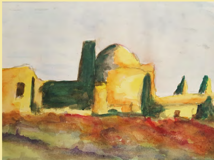
Painting by Wes