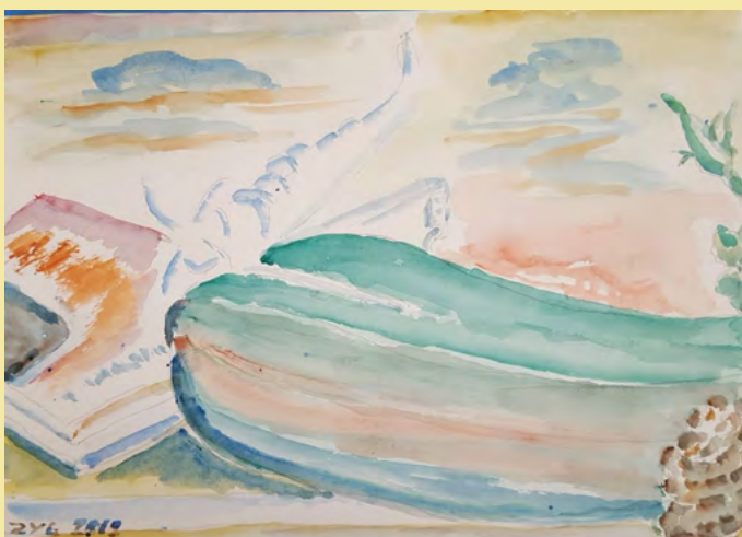
Painting by Ziggy