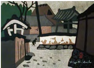
Above: three Kiyoshi Saito prints