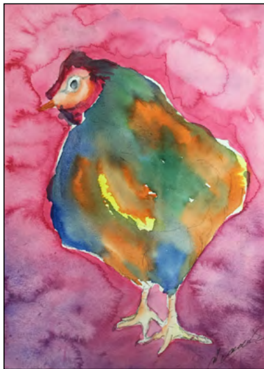
Painting by Wes