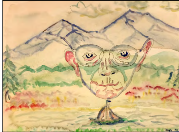
Painting by Ziggy