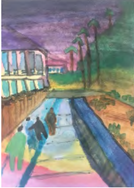
Winner 6th-8th Grade Category Pre-impressions by Aarsh Mittal

Judges comments: "Aarsh's Pre-impressions show great use of perspective to open the space and wonderful use of color and values."