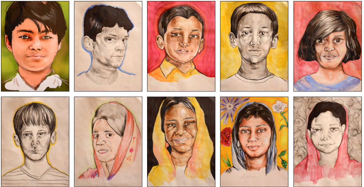
John Swett High School students' finished portraits of Pakistani students.