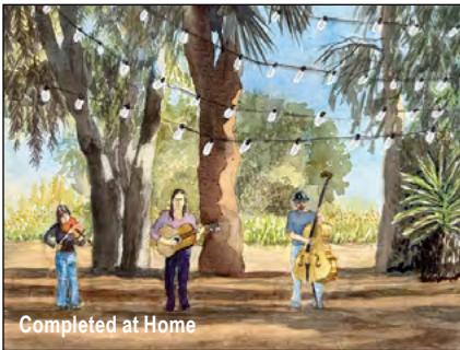
Completed at Home

This was a fairly complicated project and a number the group could not finish in the allotted time. A few completed the project at home. In the future, we plan to make this type of project a two-meeting event in order to clean up on time and complete what we set out to do. Nevertheless, a lot was accomplished in the time allowed.