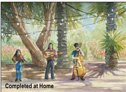
Completed at Home