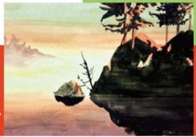
Renny Zhu's "Watercolor" category 11th - 12th grade