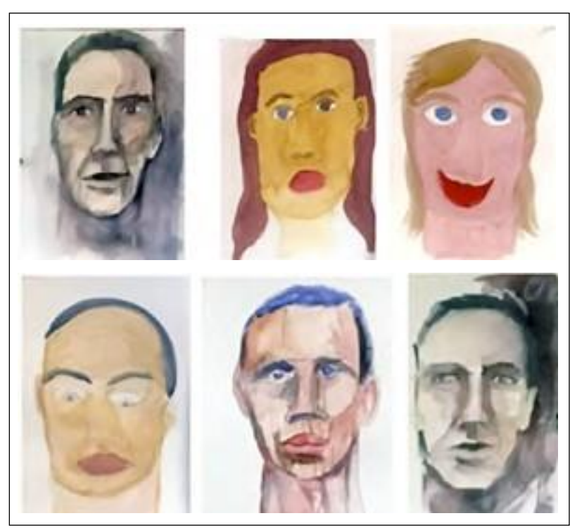
Portrait study paintings by the Oakland vets