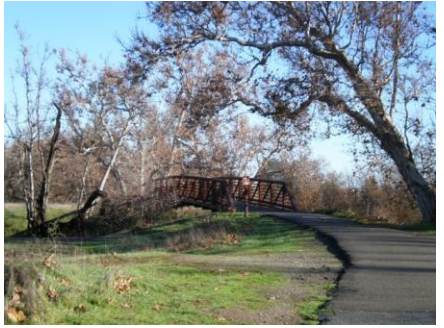
Wetmore entrance (more open)

Join CWA at one of the tri-valley's nicest parks. Surrounded by vineyards and olive groves, Sycamore Grove boasts 775 acres of parkland. Two entrances to the park each have many scenic items to paint, such as bridges, arroyos, trees, and wildlife. A 2.5-mile paved walking/bike path connects the two entrances, and there are many off-path trails for more adventurous painters. If you want to explore the park's interior, a trail bike makes that a little easier. Note: parking is $5 per car per day; one ticket is good at both entrances. Also, at both entrances are pit toilets (no sinks) and running water from outdoor spigots.