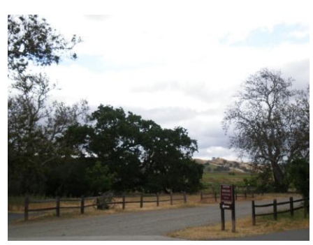
Arroyo entrance (more wooded)