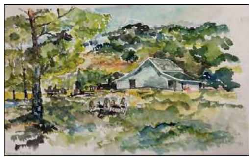
Watercolor by Chuck Dorsett