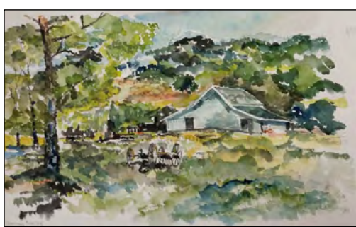
Watercolor by Chuck Dorsett